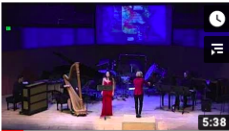
Herzgewächse (Schoenberg) Sparse orchestration in low writing for soprano. Extreme uses of low and high.