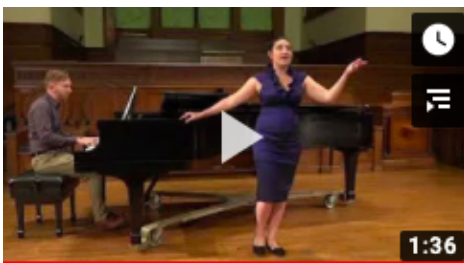
“Cockeyed Optimist” ( South Pacific /Rodgers & Hammerstein) Musical theater singing