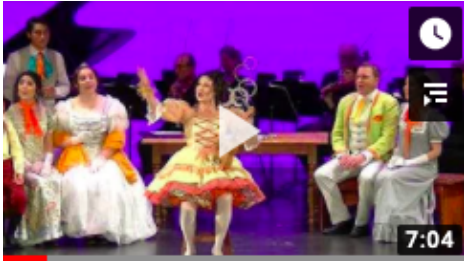
“Les Oiseaux dans la charmille” ( Les Contes d’Hoffmann /Offenbach) Standard use of coloratura soprano