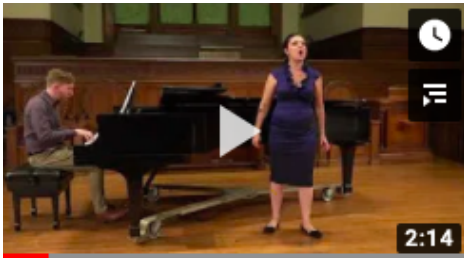
“Fear to the Sinner” ( The Tempest /Adès) Extremely high use of soprano voice with high diction.